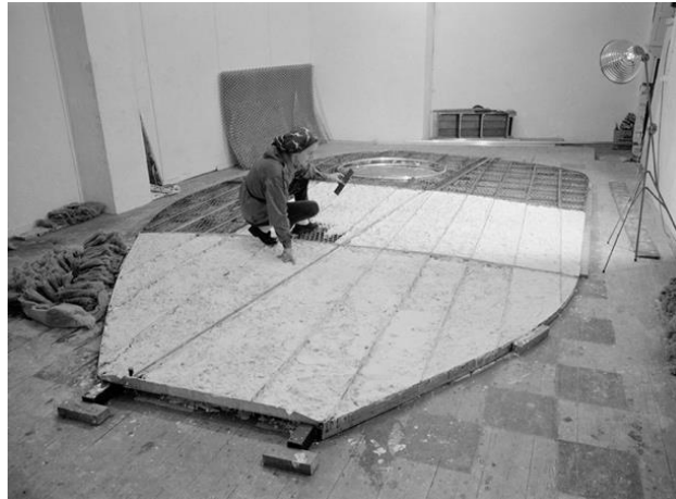
Barbara Hepworth working in the Palais on the prototype for Single Form for the United Nations. January 1961. Photograph by Studio St Ives. Barbara Hepworth © Bowness