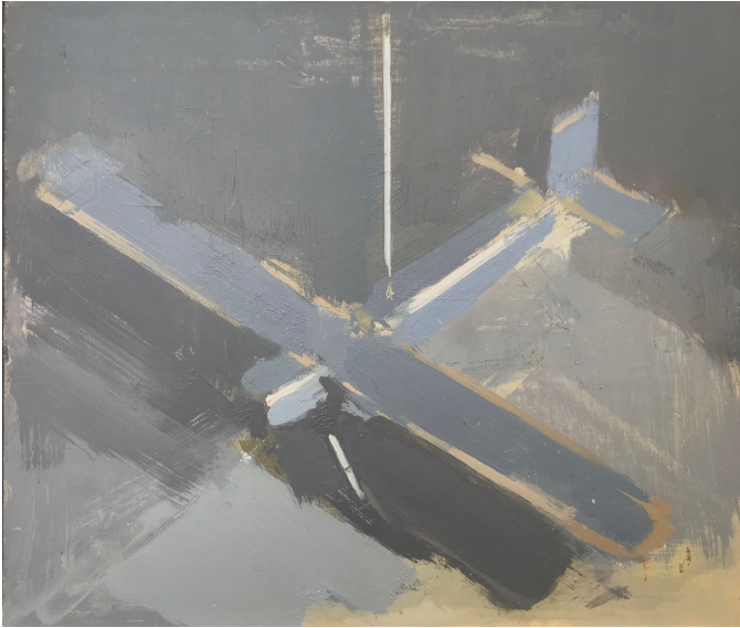
Simon Wright ' Grey Plane ' Oil on Board, 26 x 30 cm

Simon Wright's paintings are inspired by the commonplace and familiar, yet through his process, they take on a skewed logic of their own. Wright creates cardboard models and junk constructions with paintings in mind, transforming everyday items into personal interpretations that blur the lines between art and life. His works invite viewers to explore the intricate details and imaginative worlds he builds from the mundane.