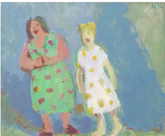
Alex Cree 'Happy Birthday' oil On Board, 22 x 27 cm