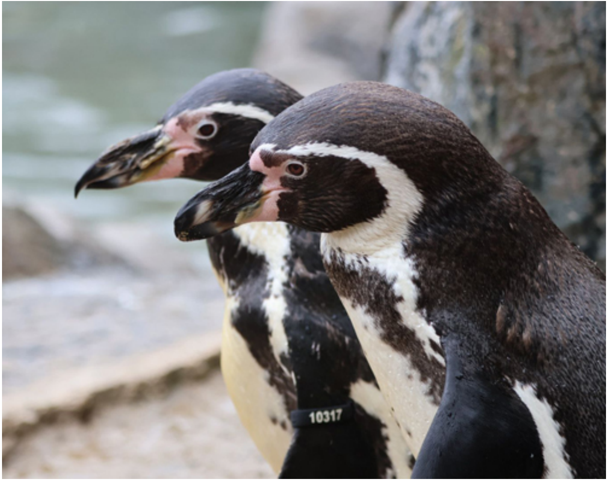
ABOVE: Spneb with companion Prince.